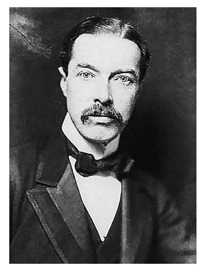
Deputy Foreign Minister of the United Kingdom Ira Crow