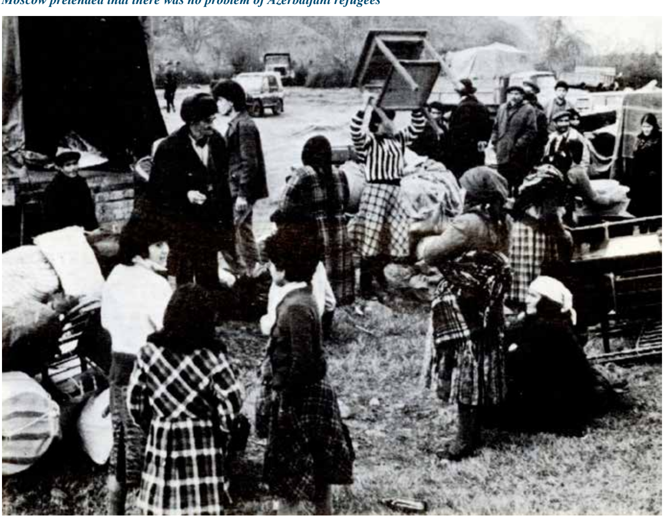
Moscow pretended that there was no problem of Azerbaijani refugees

nakert road. The situation in Agdam District, which neighbored on the NKAR, was in turmoil as the population was agitated by refugee accounts about events in Stepanakert and their complaints about atrocities and abuse against Azerbaijanis. The culmination was the assassination of two Azerbaijanis – the first victims of the Karabakh conflict – in Asgaran District. With the efforts of district activists and representatives of the authorities in Baku, the indignation of the people was contained. At a rally in Agdam, it was decided not to inflame tensions so that the death of two Azerbaijanis would not lead to more bloodshed (5). However, events began to develop by a different scenario. Soon rumors of Armenian atrocities suddenly received official confirmation in a report circulated by central TV. The growing flow of refugees from Armenia, multiplied by the disturbed state of Azerbaijani society, turned the Armenian population of the republic into hostages to the Karabakh conflict. In principle, this was the calculation of Armenian na-