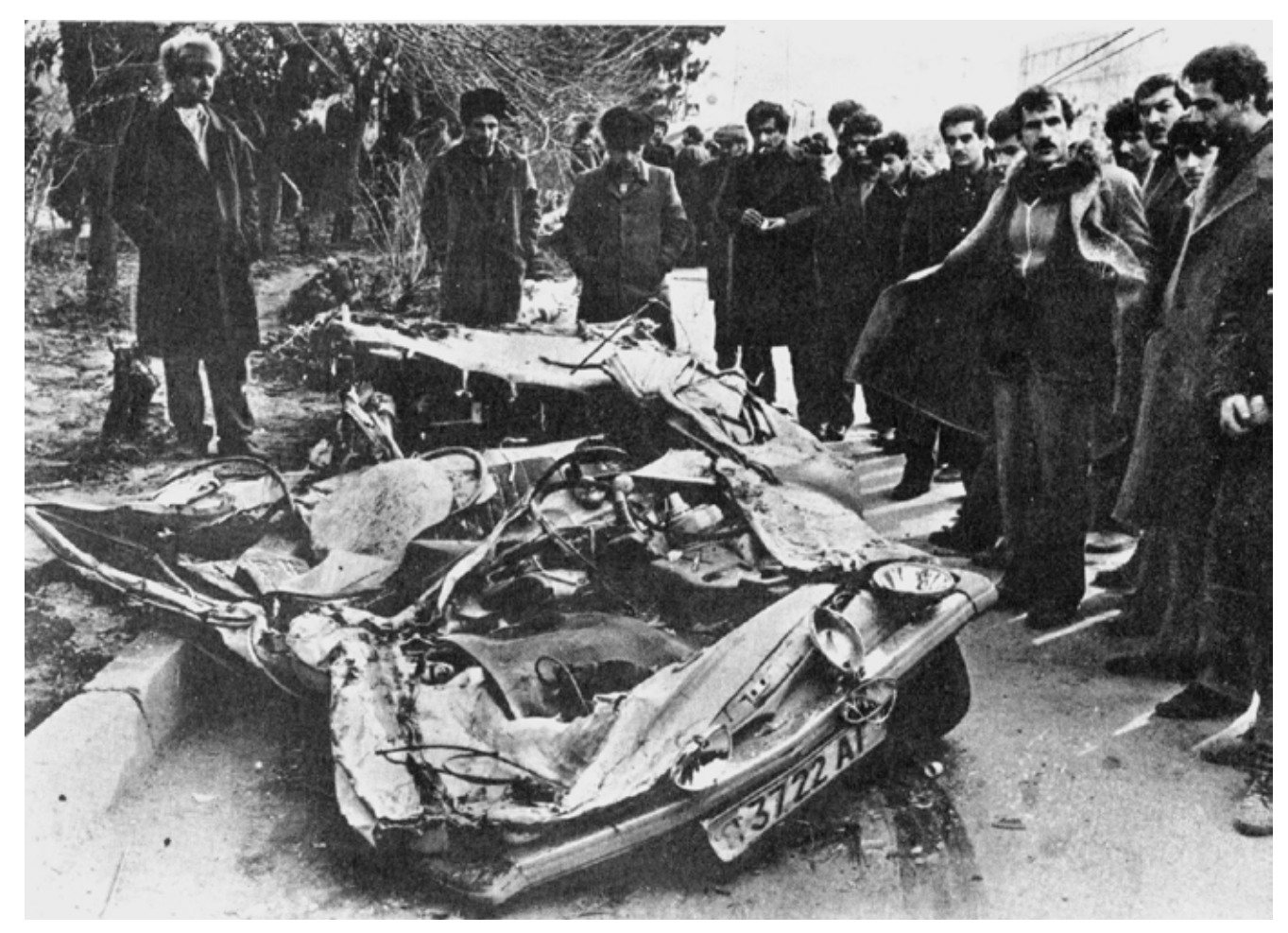
In response to public protests, Soviet troops rolled onto Baku. On 20 January 1990, hundreds of unarmed Azerbaijanis were killed and thousands wounded

10-20 men gathered around the campfire in the center of the village or town to guard the houses. And still not a single night passes without a house being set on fire. Old men, women and children go to bed dressed, even in shoes, in order to be able to jump up and run away." Farmer Humbat Abbasov described his experiences: "In our village of Artashat in Masis District they set fire to three houses. Since 19 February, we have not been allowed to the markets, and the harvest we have grown with hard work is being lost. You will not find a single Azerbaijani surname in the records of hospitals, clinics and health centers in Armenia. We are refused medical care. They do not sell bread and products to us. They do not allow us to use urban transport. Mass unreasonable dismissals of Azerbaijanis have begun. They literally spat in our face and shouted: Turks, get out of Armenian land." (4) Such reports about events in Armenia, the appearance of refugees on roads and in towns across the republic and their stories about what happened greatly alarmed and angered people and led to an increased need to demonstrate national solidarity.