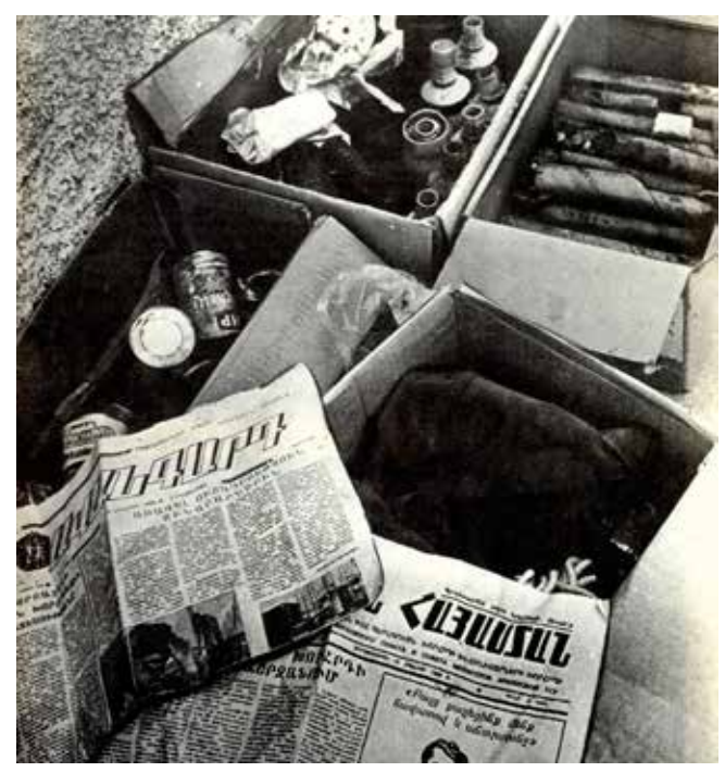
Weapons, ammunition and nationalist literature was sent from Armenia to Karabakh

10-20 men gathered around the campfire in the center of the village or town to guard the houses. And still not a single night passes without a house being set on fire. Old men, women and children go to bed dressed, even in shoes, in order to be able to jump up and run away." Farmer Humbat Abbasov described his experiences: "In our village of Artashat in Masis District they set fire to three houses. Since 19 February, we have not been allowed to the markets, and the harvest we have grown with hard work is being lost. You will not find a single Azerbaijani surname in the records of hospitals, clinics and health centers in Armenia. We are refused medical care. They do not sell bread and products to us. They do not allow us to use urban transport. Mass unreasonable dismissals of Azerbaijanis have begun. They literally spat in our face and shouted: Turks, get out of Armenian land." (4) Such reports about events in Armenia, the appearance of refugees on roads and in towns across the republic and their stories about what happened greatly alarmed and angered people and led to an increased need to demonstrate national solidarity.