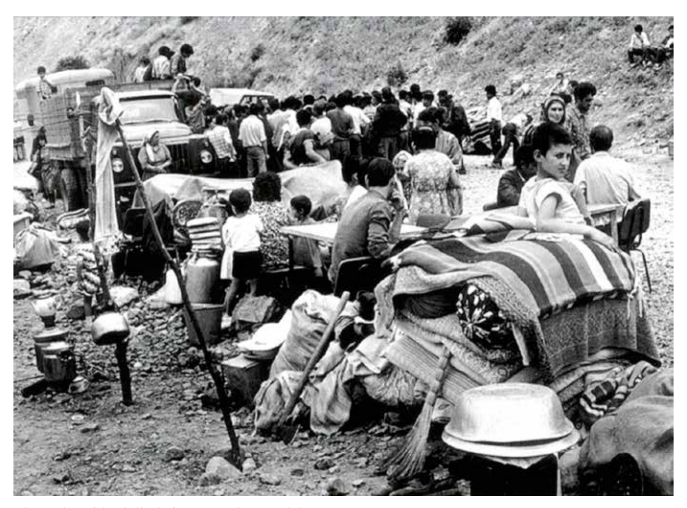
The ousting of Azerbaijanis from Armenia was gaining momentum

The emotional atmosphere in Baku began to heat up even more when reports started coming in from Stepanakert about the appeal of deputies of the regional council to join Armenia. On 22-23 February, the first crowded, yet spontaneous rallies were held in front of the building of the Central Committee of the Communist Party of Azerbaijan. Only on 24 February 1988, did the press, in the form of a TASS report, finally publish the official position of the CPSU Central Committee on the events in the NKAR, which set out the decision of the Politburo of the CPSU Central Committee. It officially described the territorial claims and separatist demands as unreasonable and unlawful, and thus, the center did not support them. However, it did not say anything about the refugees, as well as the involvement of Armenia in the events in the NKAR. In contrast to the clear estimates contained in the decision of the Politburo, a hefty element of ambiguity was added to the Kremlin's position by Mikhail Gorbachev's appeal to the Azerbaijani and Armenian peoples in the same days. Gorbachev's