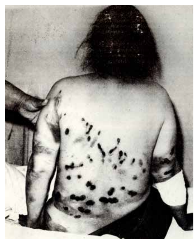
This Azerbaijani woman miraculously survived – devious Armenian chauvinists lacerated her body with a screwdriver

were launched against 96 people, this did not calm the Armenian extremists. They decided that the events in Sumgayit were not given a political and legal assessment. The Armenian side needed this to justify another