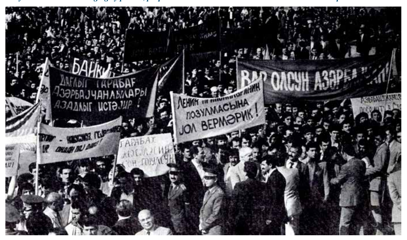
Rally in Baku in 1988. Judging by posters, people believed that Moscow would resolve the Karabakh problem

belonged to Armenians from time immemorial and secondly, on the right of nations to self-determination, which was unilaterally blown out of proportion and tak-