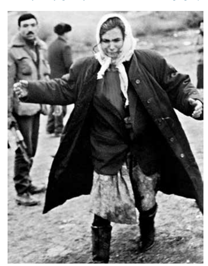
The eviction of Azerbaijanis was accompanied with murder. People lost their kith and kin

tionalists sitting in Yerevan and Stepanakert as they wanted Armenian blood to be shed in order to make a propaganda show about it. Killings of Armenians would give these individuals a reason to prove that Azerbaijan is violating the rights of the Armenian population and the two peoples are not compatible for further co-existence. Therefore, a dead Armenian was more valuable to them than a living one as he could greatly benefit the cause of propaganda. Also, the favorite tactic of the Armenians was to seek confrontations with the authorities, calling it oppression in their propaganda. Such behavior of the Armenian nationalists was noted even by foreign journalists who ever had to face them. For example, back in 1919, the British military journalist Scotland Liddell, who was specially sent to Azerbaijan from London and was at the British mission in Shusha, wrote: "Whenever an Armenian is killed, he rises up and shouts - I was killed during the beatings." (6) This was the tactic of those who organized the Sumgayit provocation, one of the leaders of which was Armenian E. Grigoryan, who was previously convicted three times. Of course, fuel to the fire was added by the refugees that were in the city, mostly from Kafan District of Armenia, with their stories of the pogrom committed by Armenians in areas inhabited mainly by Azerbaijanis. Perhaps this was the very spark that caused the outbreak of the 28-29 Feb-