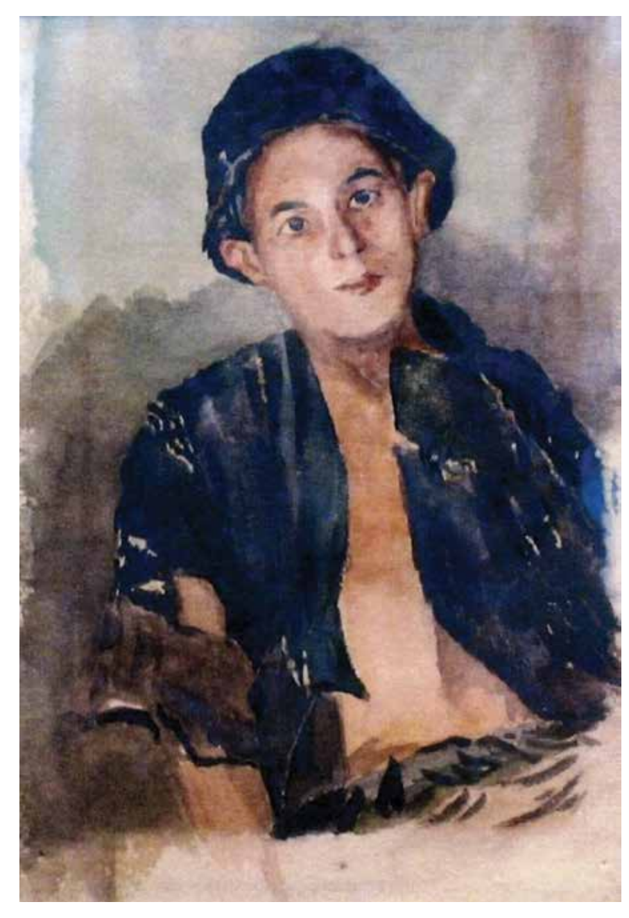
The state of Azerbaijanis being deported from their native lands did not worry the tsarist authorities and later the Soviets. «The Refugee Boy». Artist B. Kangarli, 1916

staunch peacekeepers, and make loud-mouthed promises about their commitment to resolve the conflict, and then take their words back at the last moment. Such a