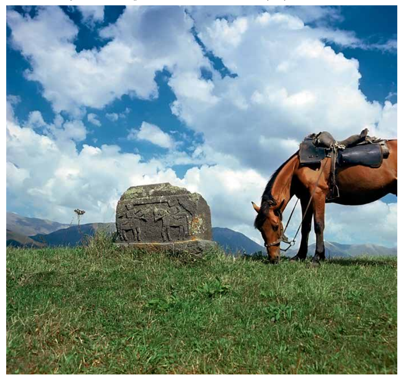
Up until the deportation of Azerbaijanis from the territory of Irevan Province, there were hundreds of medieval Muslim gravestones here, which were later destroyed by Armenian chauvinists

to the Armenian prime minister on 15 May 1919, representatives of the Nakhchivan people rightly assessed this act of the British command «as violence against the Muslims of these areas and expressed their fair protest to General Thomson».<sup>23</sup> The allied command considered the Armenian government in Nakhchivan as a temporary solution